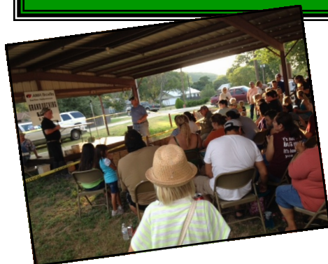
Watching the "Snake Man" from Rattlesnake Republic