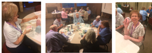
Good times at the Young at Heart Retreat!

Our Coordinators & Counselors will begin their staff training beginning on May 31st! Please add our staff to your church's and your personal prayer lists as we begin our journey together, learning what it is to be "Living in God's Time", and how we can all be effective leaders for Christ! Make sure you pay attention to our Campfire News, as we will be introducing our staff to everyone through there!